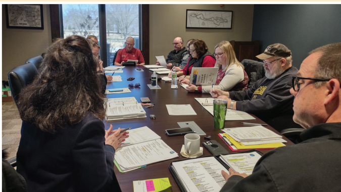
PACEDC Board members meet at their monthly board meeting.